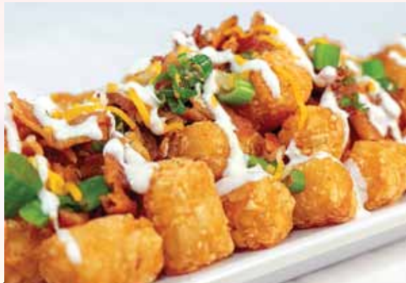
Loaded Tater Tots - 13.99