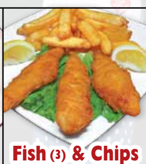
Fish (3) & Chips

SORRY NO SENIOR DISCOUNTS ON ANY SPECIALS OR WITH ANY COUPON