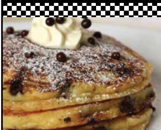
Chocolate Chip Pancakes