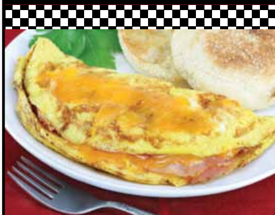
Ham & Cheese