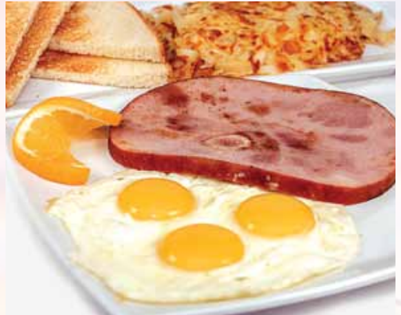
Ham Steak & Eggs - 15.49