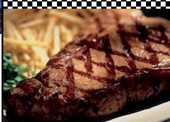
Mr. D's Broiled Steak

Macaroni & Cheese - 6.79 • Kids Drinks - 2% milk or soft drink - 2.29