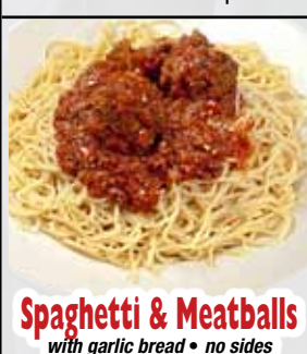
Spaghetti & Meatballs with garlic bread • no sides

served with soup or salad, grilled veggies and choice of rice, corn, mashed potatoes or seasoned fries.