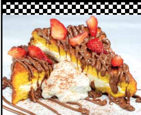
Stuffed nuttella® French Toast