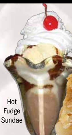
Hot Fudge Sundae

~ Enjoy your meal with one of the following ~