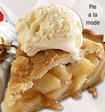
Pie a la mode