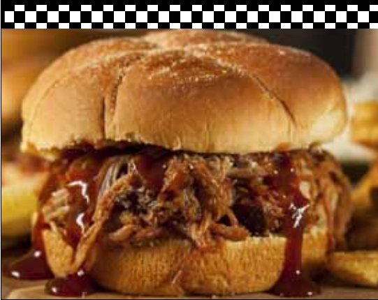
Pulled Pork Sandwich