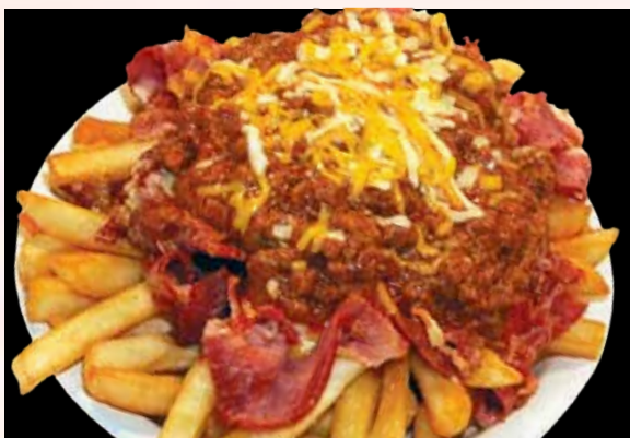
Pastrami Chili Cheese Fries - 14.99