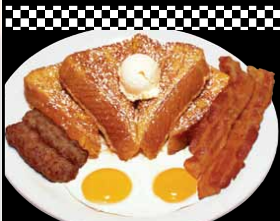
French Toast Combo