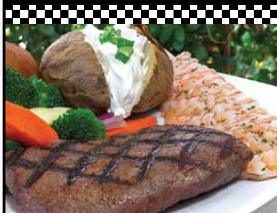
Surf & Turf